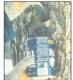
Cliff Sadof Purdue University

—Physically remove the egg masses. Scrape the egg masses into a jar and microwave on high for 2 minutes or cover them with soapy water for at least 2 days to kill the eggs. Be sure to kill the eggs, as masses just scraped onto the ground will survive to hatch in May. Wear gloves when handling the egg masses as the hairs in the "felt" can cause skin rashes.